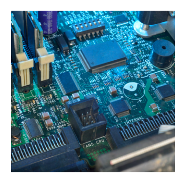
Future Computer Scientist