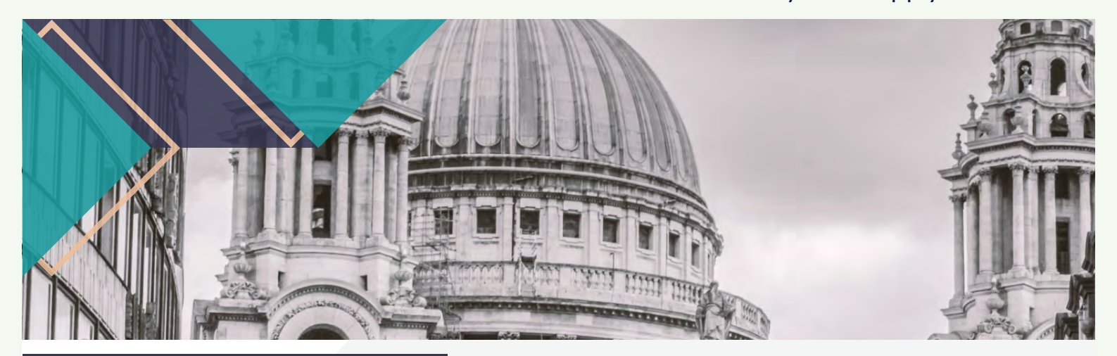
The offer is exclusive to HSBC Premier customers only. T&Cs apply