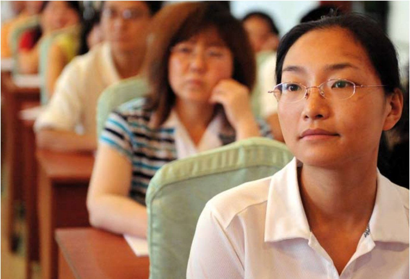
A teacher training class, part of the Rural Children Programme.