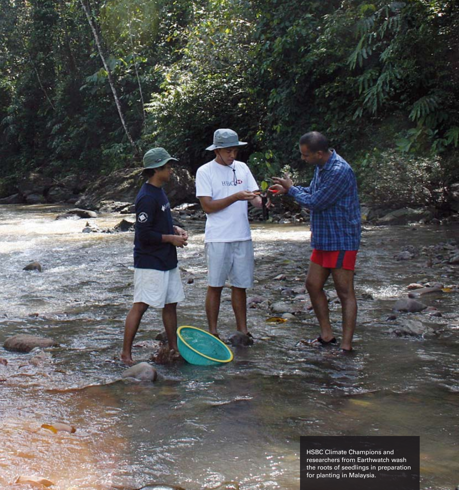
HSBC Climate Champions and researchers from Earthwatch wash the roots of seedlings in preparation for planting in Malaysia.

climate change, including the Amazon, Ganges, Thames and Yangtze, which together support the livelihoods of 450 million people. The HSBC Climate Partnership has helped WWF to support 33 nature reserves in China to tackle increased flooding, reduce pollution and safeguard endangered species in the central and lower Yangtze River.