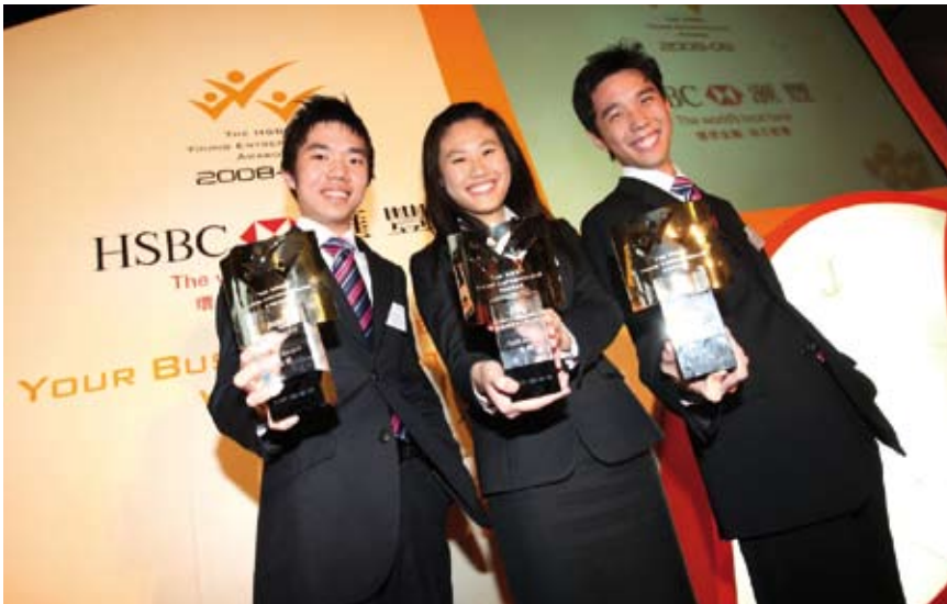
Young Entrepreneur Awards 2008-09 Hong Kong Final Gold Award winners from The Chinese University of Hong Kong.