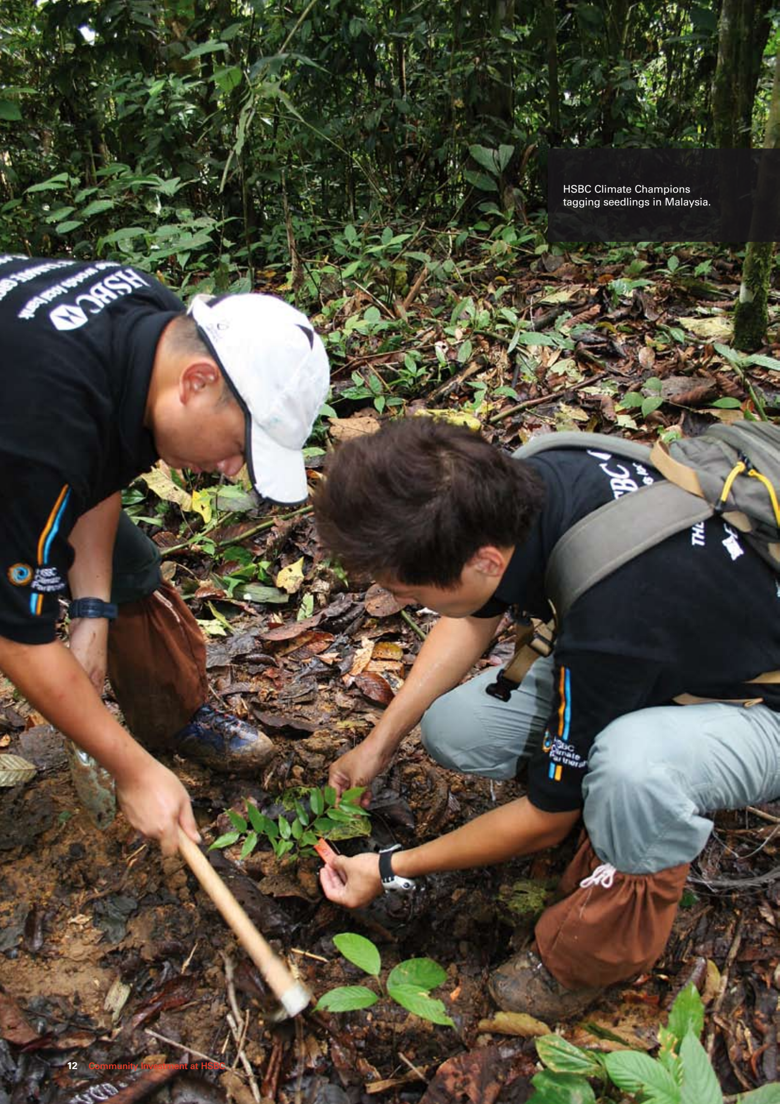
HSBC Climate Champions tagging seedlings in Malaysia.