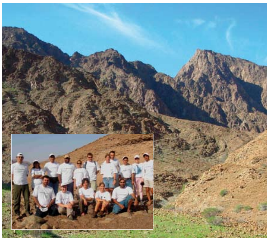
HSBC volunteers at Wadi Wurayah.

HSBC is investing US$10,500 over four years to improve the productivity of fruit trees and support sustainable livelihoods of local farmers in El Salvador.