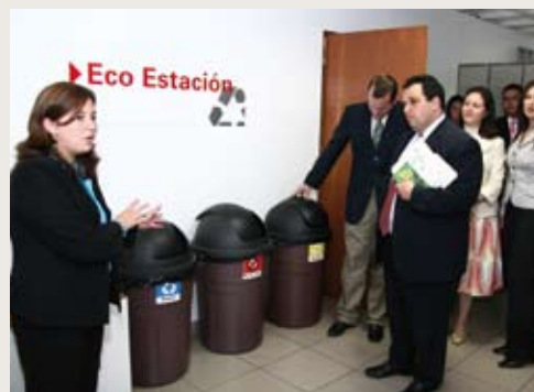
Explaining recycling facilities to colleagues in El Salvador.