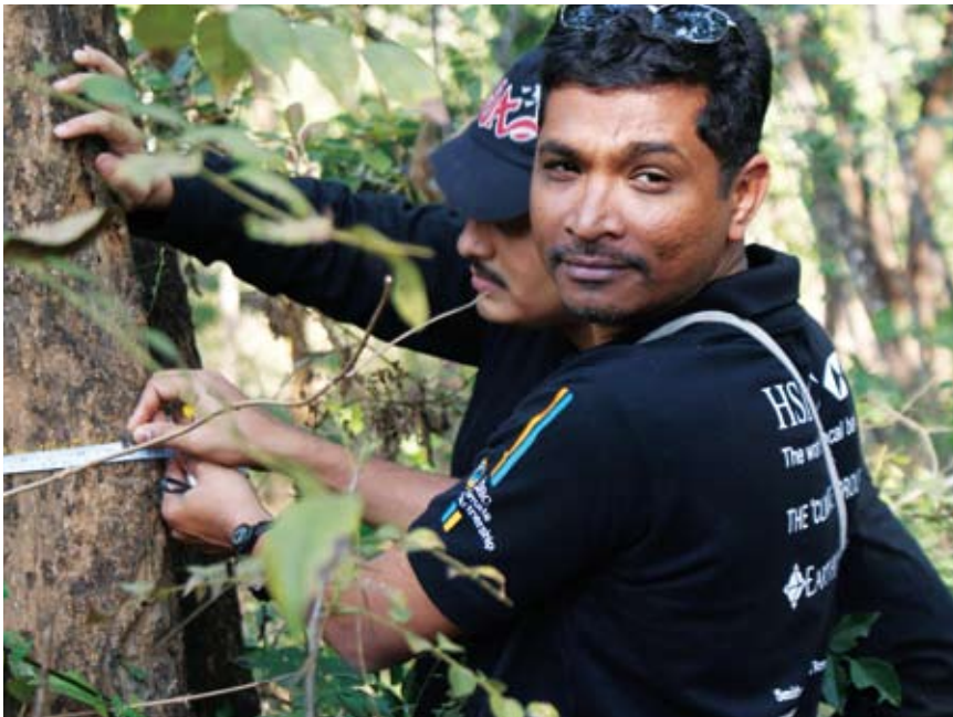
HSBC Climate Champions surveying trees at the India Regional Climate Centre.

We are already seeing some impressive achievements: The Climate Group works with corporates and government leaders in some of the world's cities to tackle climate change. Participation in the HSBC Climate Partnership has enabled the launch of new offices and recruitment of new members in Beijing, Hong Kong and Delhi plus the launch of the UK Together campaign, helping households save carbon dioxide by providing cheap and easy ways for consumers to reduce their carbon footprint.