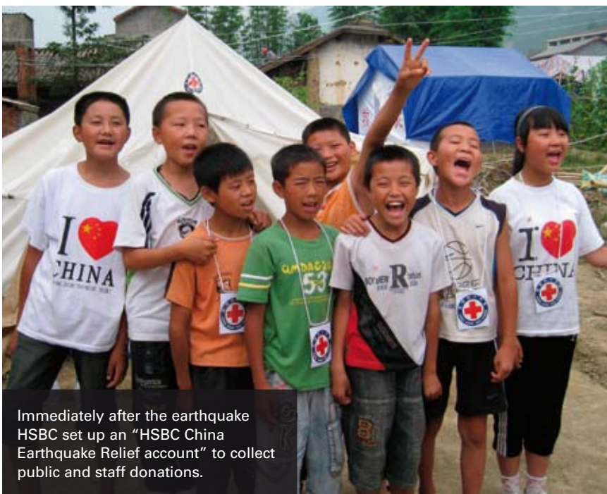
Immediately after the earthquake HSBC set up an "HSBC China Earthquake Relief account" to collect public and staff donations.

As a result the Red Cross has been able to rebuild schools and homes and provide essential education facilities, medical equipment and physical and psychological support services.