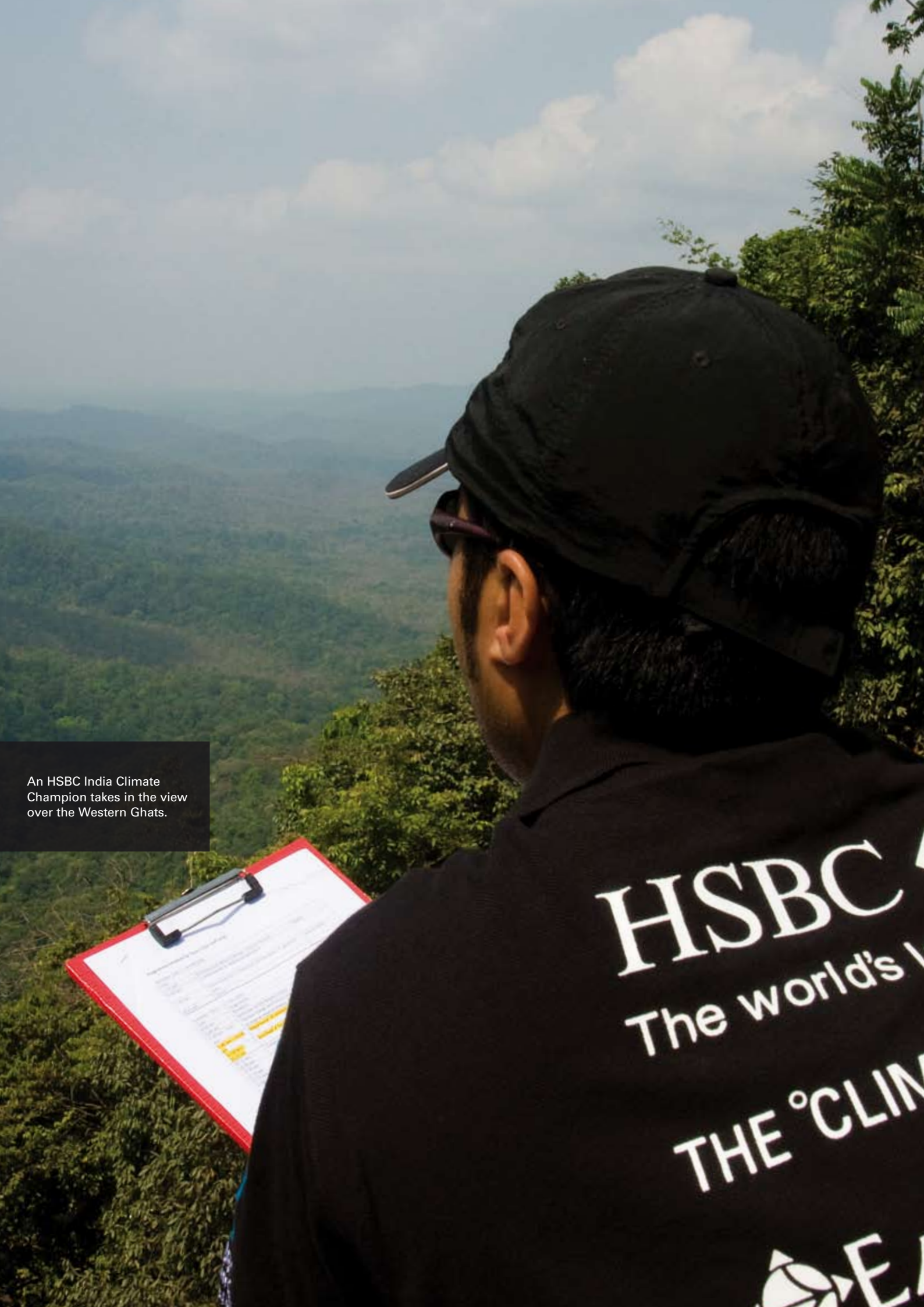
An HSBC India Climate Champion takes in the view over the Western Ghats.