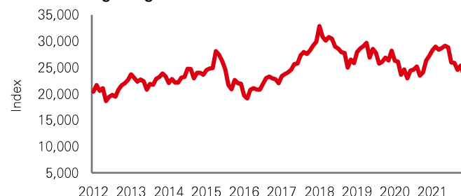
Table 2. Hang Seng index