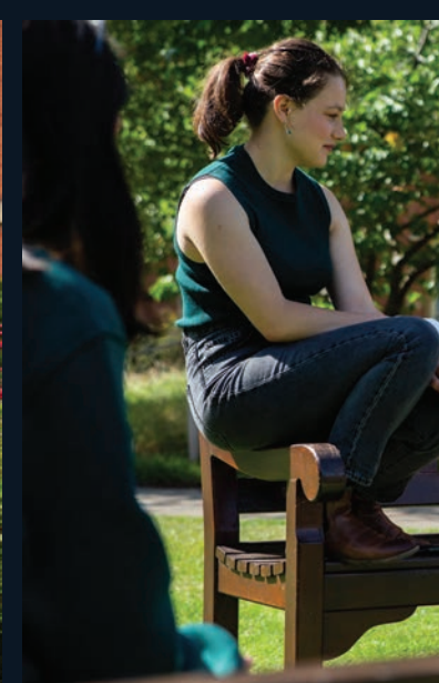
The offer is exclusive to HSBC Premier customers only. T&Cs apply.